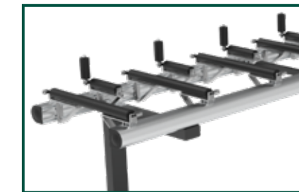
DETAIL OF PORTER XL

Loading side roller table with bar accumulation table.